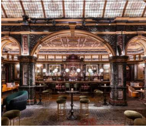
Marble Bar, Hilton Hotel Sydney