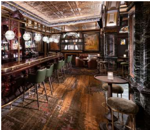
Marble Bar, Hilton Hotel Sydney