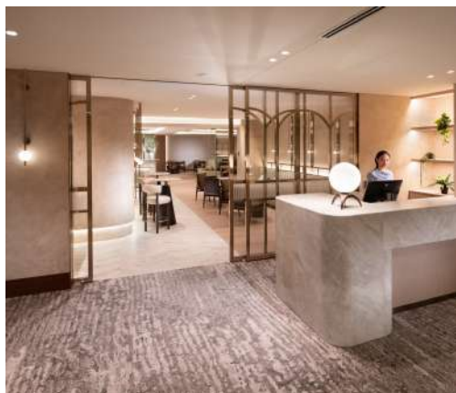
Executive Lounge Reception, Hilton Hotel Sydney