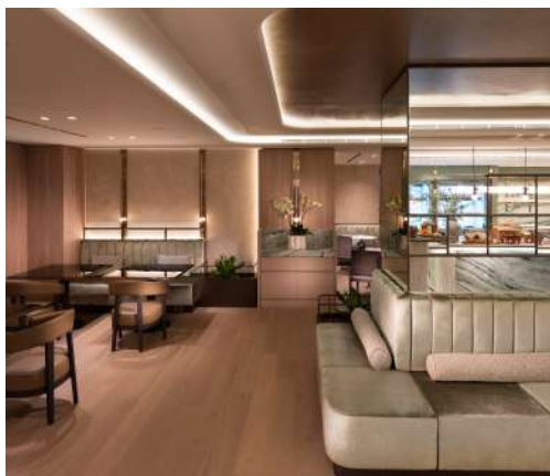
Executive Lounge, Hilton Hotel Sydney