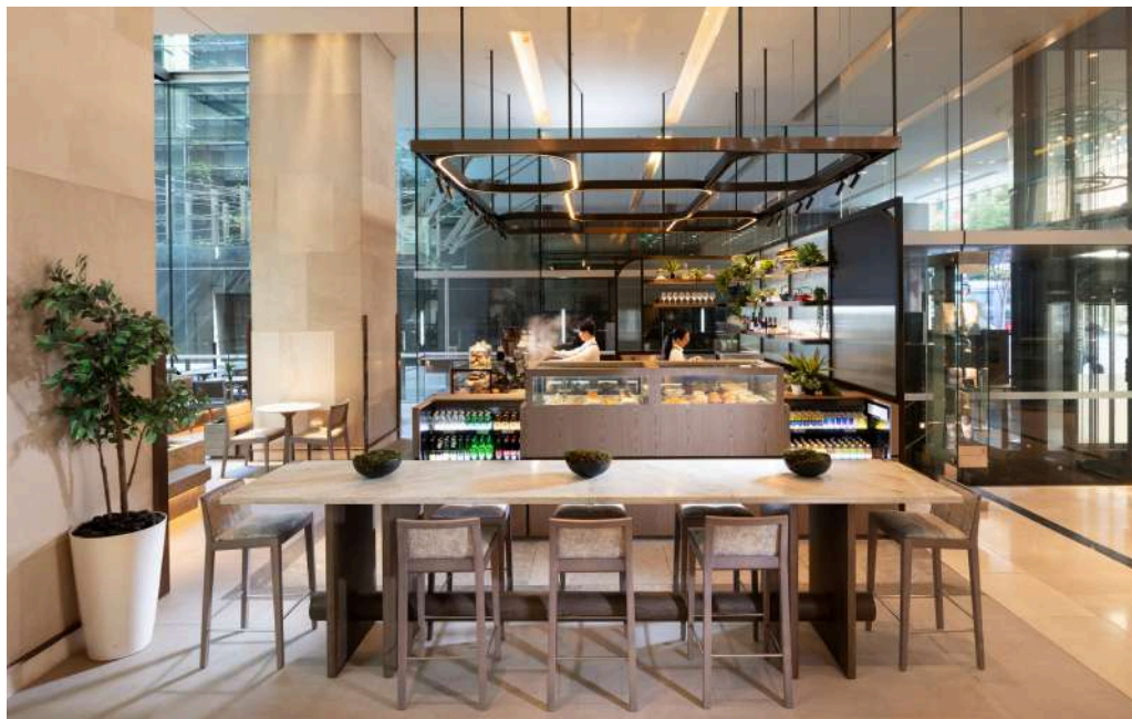
Café Cino, Hilton Hotel Sydney