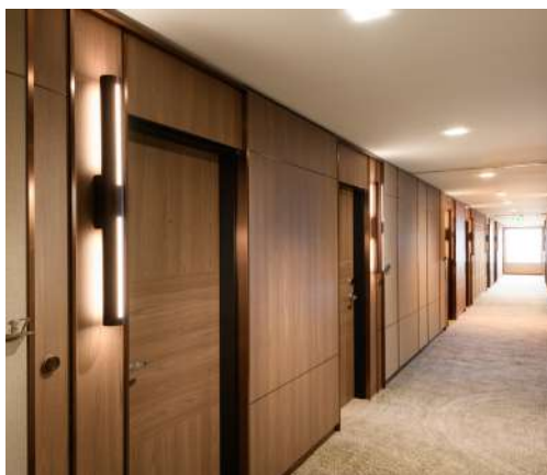
Guest Corridor, Hilton Hotel Sydney