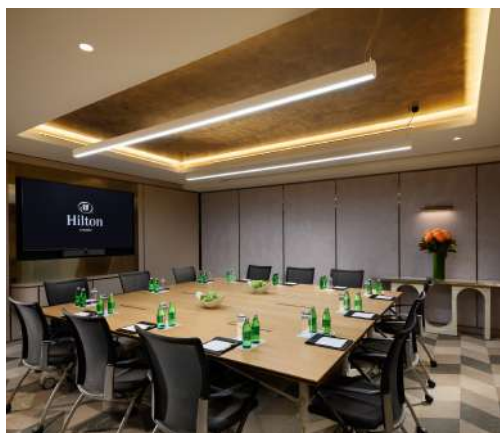
Boardroom, Hilton Hotel Sydney