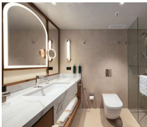
Guest Bathroom, Hilton Hotel Sydney