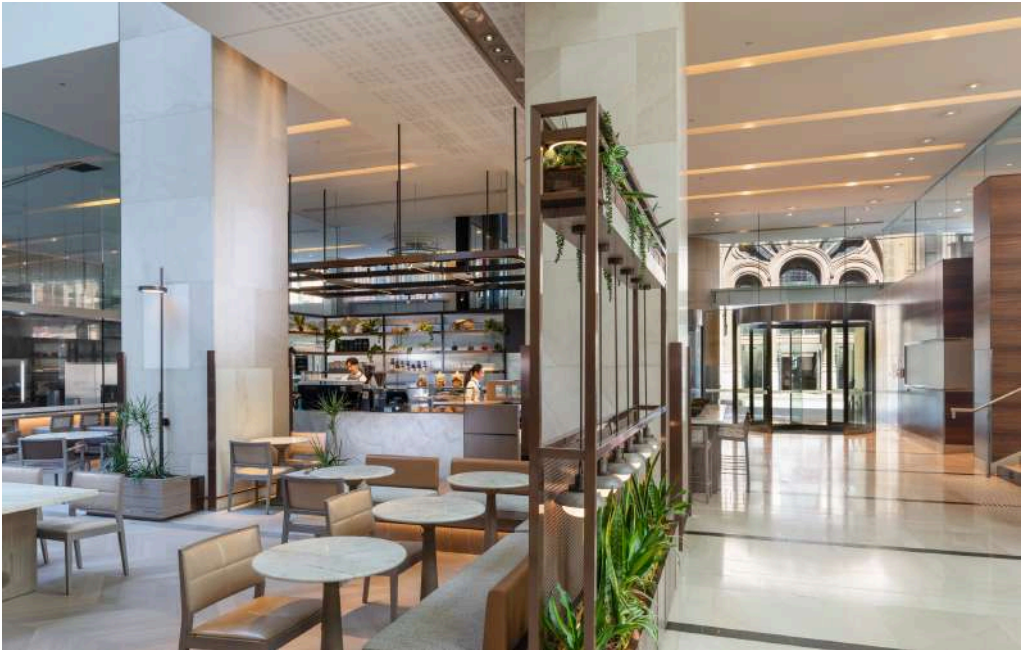
Lobby and Lobby Lounge, Hilton Hotel Sydney