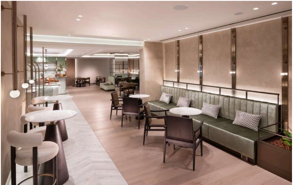
Executive Lounge, Hilton Hotel Sydney