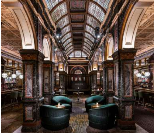
Marble Bar, Hilton Hotel Sydney